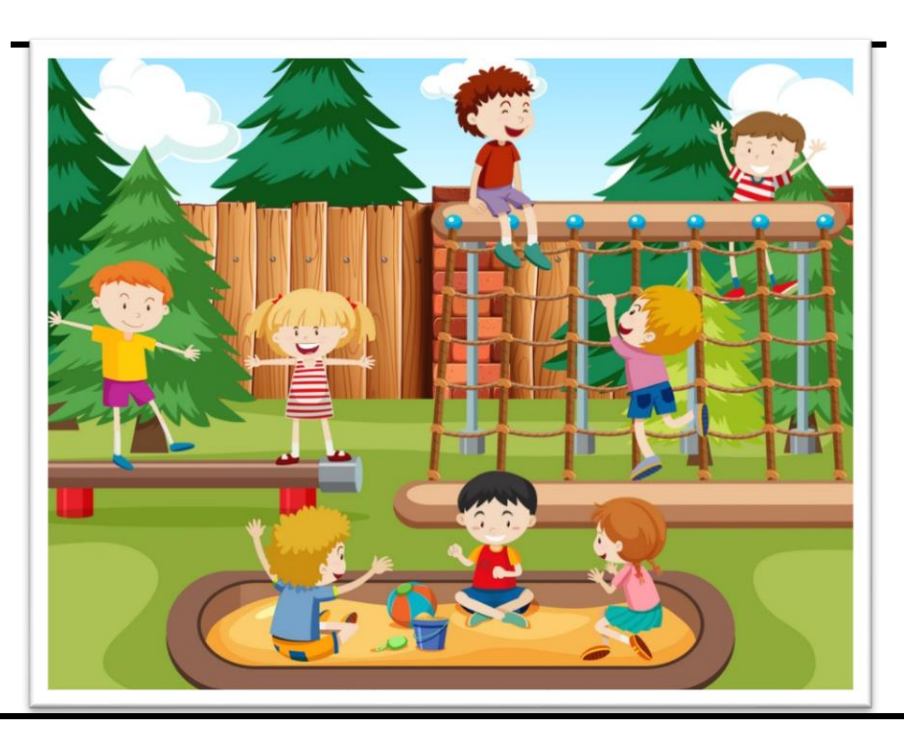
Verbs I Found

Look at the pictures below. Can you find at least 5 verbs in each of the pictures? Remember a noun is a person, place, thing or idea.