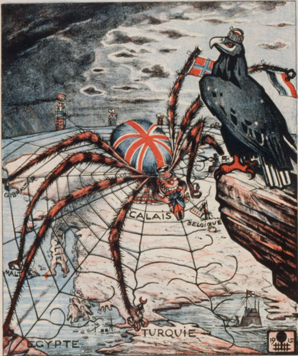
L'ENTENTE CORDIALE ♥ 1915